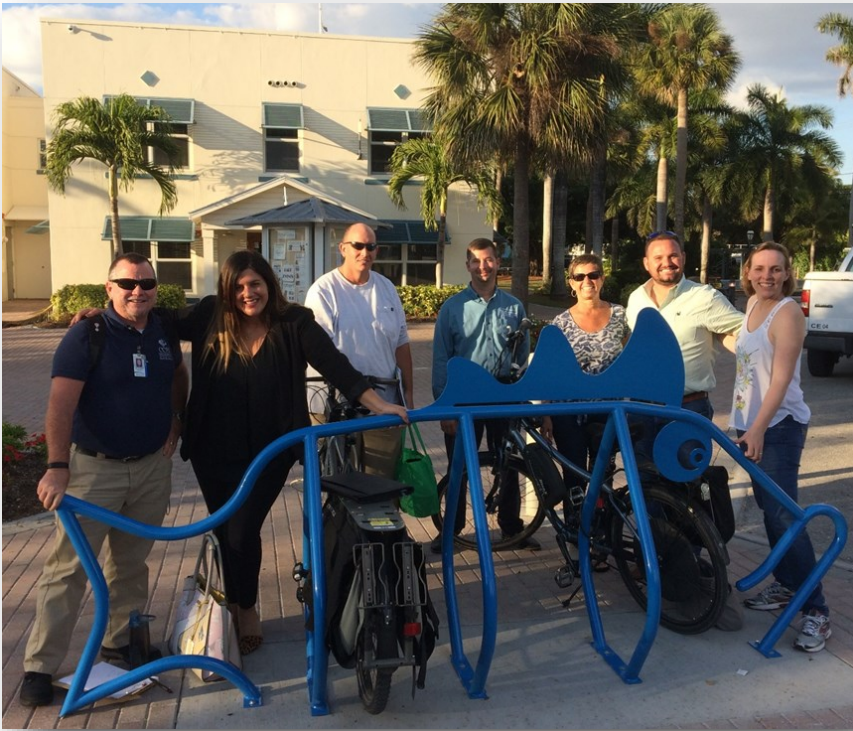
The Bicycle Pedestrian Committee standing near a fish inspired bike rack that has been installed near the Liles Hotel in downtown Bonita Springs