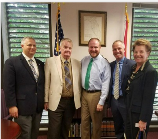
City Council members meeting with Representative Matt Caldwell in Tallahassee for the Legislative Session.