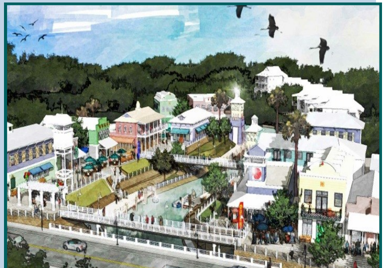
Right: rendering of an "Old Florida" style design

The deadline to submit bids is April 14, 2020 and the City looks forward to reviewing submissions. If you would like additional information, please visit www.bonitaspringsimperialcrossing.com .