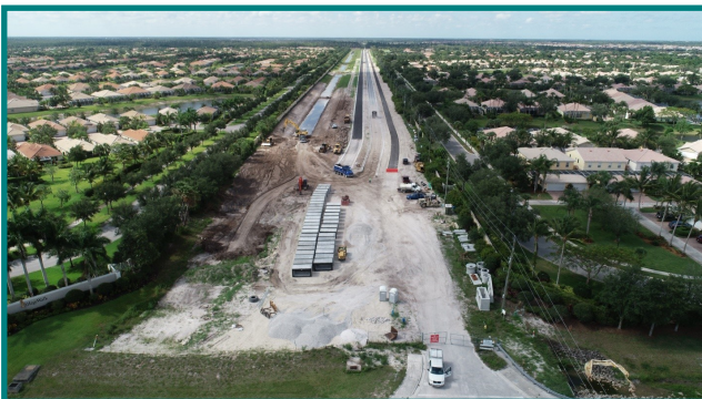
View of Logan Boulevard during construction.

Foregoing any unforeseen challenges, expectations are that this road connection will officially open in early 2020. See photos below.