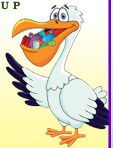
Pete the Pelican

VOLUNTEERS NEEDED! FOR INFORMATION, PLEASE CALL (239) 949-6262