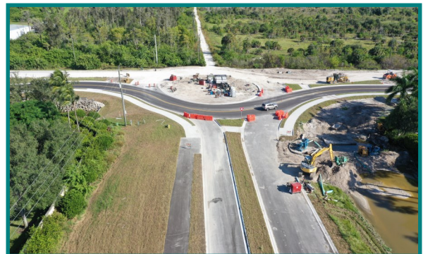
View of roundabout at the Bonita Beach Road end of Logan Boulevard.