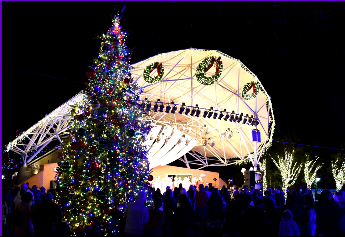
Riverside Park lit up for Holiday in the Park on December 3, 2019